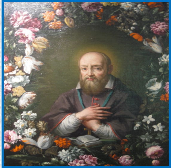
St. Francis de Sales ~ Pray for Us