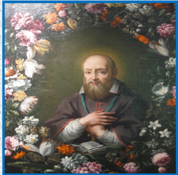
St. Francis de Sales ~ Pray for Us