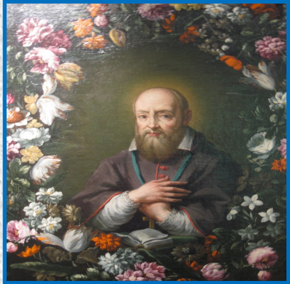
St. Francis de Sales ~ Pray for Us