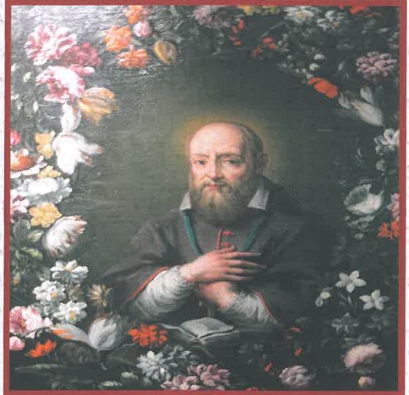
St. Francis de Sales ~ Pray for Us