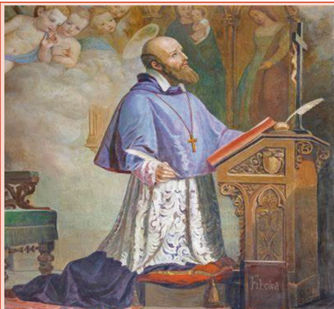
St. Francis de Sales ~ Pray for Us