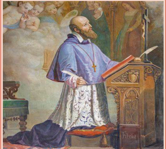
St. Francis de Sales ~ Pray for Us